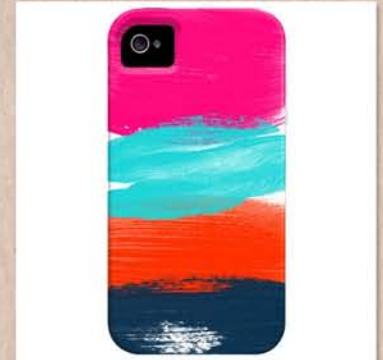
seen on pinterest