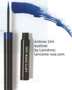
Artliner 24H eyeliner by Lancôme; lancome-usa.com.