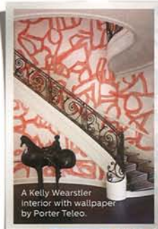
A Kelly Wearstler interior with wallpaper by Porter Teleco.