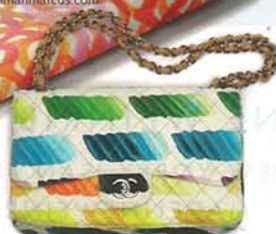
Flap bag by Chanel; chanel.com.