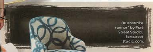
Brushstroke runner* by Fort Street Studio; fortstreetstudio.com.