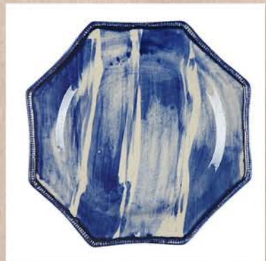
seen on pinterest