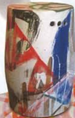
Ceramic stool by R5ceramics; thefutureperfect.com.